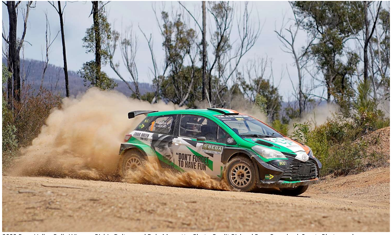
2023 Bega Valley Rally Winners Richie Dalton and Dale Moscatt

Round 2 of the NSW Rally Championship Round 4 of the East Coast Classic Rally-2WD Series Round 4 of the East Coast Classic Rally-4WD Series Round 2 of the NSW Clubman Rally Series Round 2 of the NSW Hyundai/Kia Rally Series Round 3 of the ACT Regional Rally Series